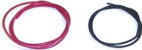
Size 12 Stranded Wire